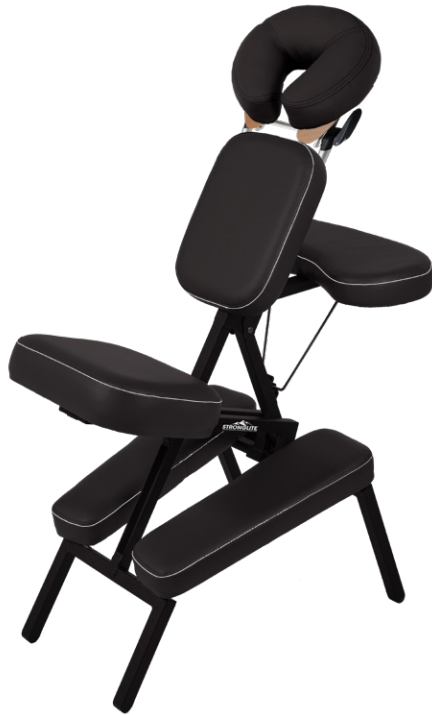
MicroLite™ Portable Massage Chair

Congratulations on the purchase of your new MicroLite™ portable massage chair by Stronglite. With proper care, your chair should provide many years of healing.